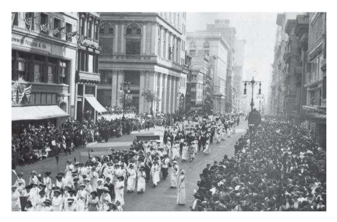
Credit: Paul Thompson/Topical Press Agency/Hulton Archive/Getty Images Copyright © 2018, 2016, 2013 Pearson Education, Inc. All Rights Reserved.

Amending the Constitution to givewomen the right to vote was an important step in the women's rightsmovement. Here suffragettes marchin New York City in 1913 for the right to vote.